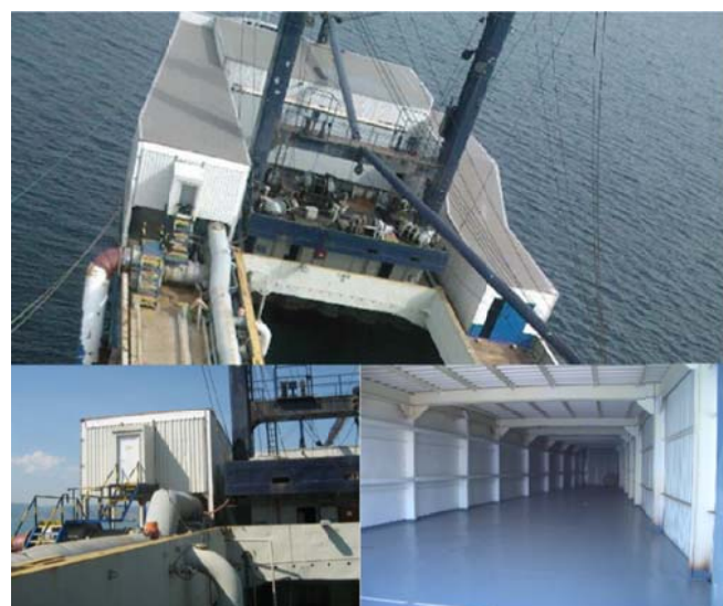
Figure 2. Fish processing unit.

A fish processing unit was also built on the forepeak (Figure 2).