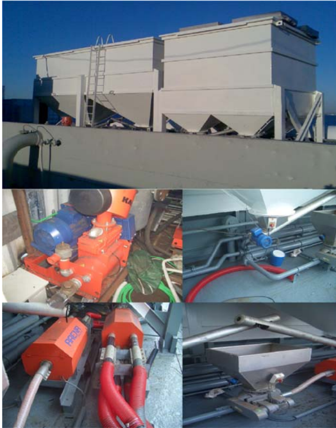
Figure 7. Feed silos and automatic feeding systems.

Feeding was operated automatically using ARENA baiting system and program. Six different silos with 40 tones capacity were produced to stock baits (Figure 7).