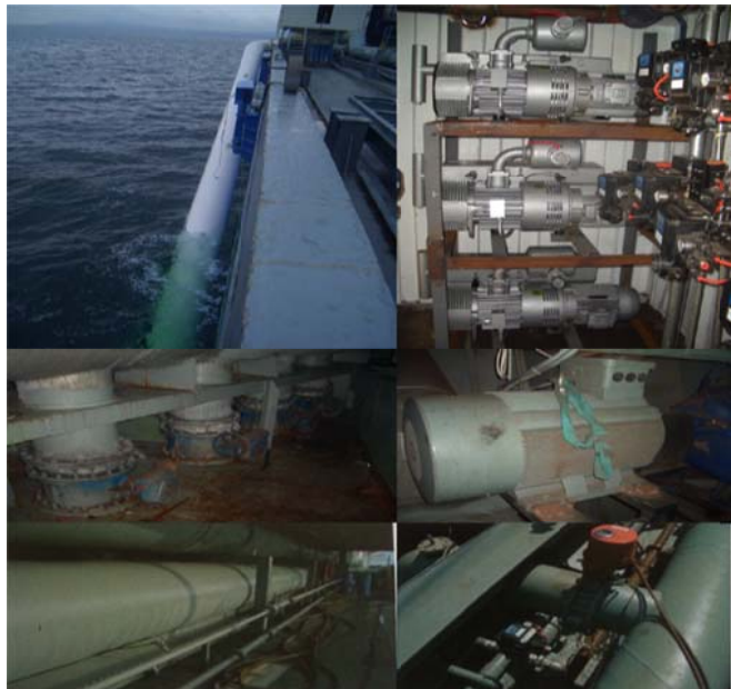
Figure 4. Water circulation system (Suction pipe, vacuum compressors, sea chest valves, circulation pumps, brower valves)

Two different methods were used to pump the water into the fish tanks (Figure 4). First of all, a suction pipe with a length of 60 m and a diameter of 1 m was used to transfer water at optimum temperature from desired depth into the tanks. Secondly, at the periods when the water temperature on the surface was optimum the pumping was done through sea chest (kinistin). The water soaked from suction pipe by three vacuum compressors was transferred to tanks using 5 circulation pumps (2500 L h -1 ) after transferred to deck head. At the time when water was