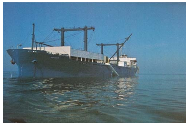
Figure 1. The dry cargo ship (19030 Kt DWT), converted to a fish farm

A 19030 Kt DWT freight ship with a 154.33 m length, 22.80 m breadth and 12.5 m depth was bought in order to transform into an integrated fish farm (Figure 1). The all dry cargos of the ship used in the research were repaired and made a new modification of all members on the slipway, and were transformed into fish tanks in UM shipyard, Izmit-Turkey.