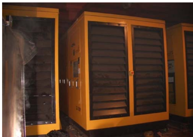
Figure 6. Generators.

Two different types of electrical generator were used on the ship (Figure 6). One of them was YANMAR mark. It was completed from three similar generators to generate electricity for ship and the other generator was CJ700P Perkins with 708 kW. The second generator was used for the circulation pumps and oxygen generators, and also other aquaculture equipments.