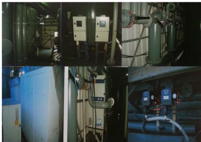
Figure 3. Oxygen system of the ship (Oxygen generators, air filters, air compressors, air dryer, Ebro valves)